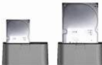
Install 2.5" HDD