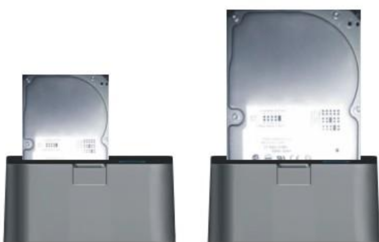
For 2.5" SATA HDDs