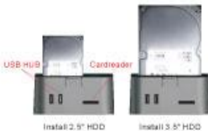
Install 2.5" HDD